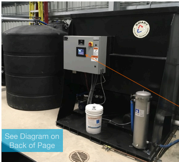
See Diagram on Back of Page

The ST400 is the optimum companion to the Smart Technologies systems: SDC51(Final Filtration & Distribution Center) & STS10 (Oil/Water Separation)